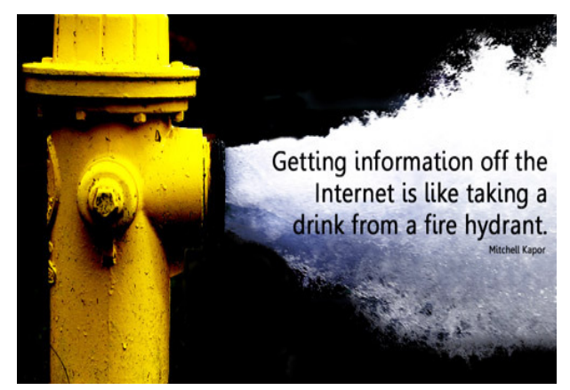
Fig. 1 Information overload

we tend to believe that the life is getting easier, as you can easily find so many information available for any area under discussion you might need, but on the other hand, there are so many information accessible, that it is difficult to differentiate which is the right information to be presented. The general causes of information overload include: a rapid level of information being produced, a high number of channels available for just in time incoming information (email, text message, and instant message), and huge amount of old information to excavate through, contradictions in existing information and so on.