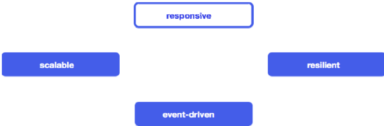
Figure 2. The reactive traits [13]

The next interesting concept is Abstract Task Graph [14]. The Abstract Task Graph (ATaG) is a data driven programming model for end-to-end application development of networked sensor systems. An ATaG program is a system-level, architecture-independent specification of the application functionality. ATaG model maps the network graph to an application graph.