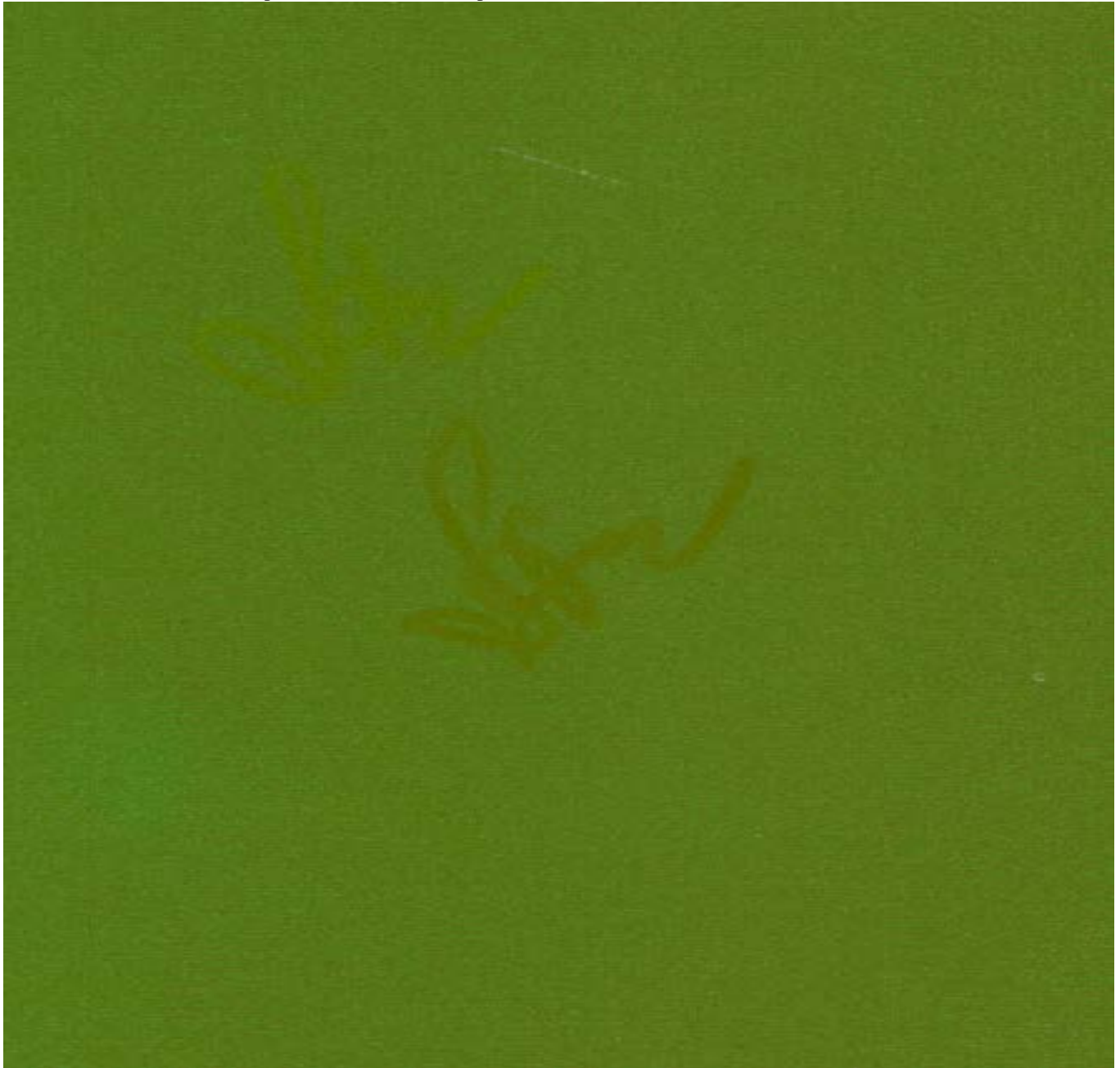
Figure 1: Initial image.

digitized image 444×562 pxl was saved in .bmp format. Then by means of Photoshop v. 12.1 its dynamic resolution was driven up to 16bit/channel and file was resaved in .png format. Initial image is shown in Figure 1. The increased size allows to ascertain that one signature is visible only.