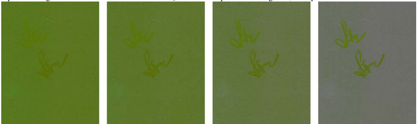
Figure 3: Saturation-contrast enhanced images ( M=1.25 ; M=1.75 ; M=2.75 ; M=4.75 ).

The second way – saturation-contrast enhancement – represents Figure 3. The reference saturation S_0=1 . For